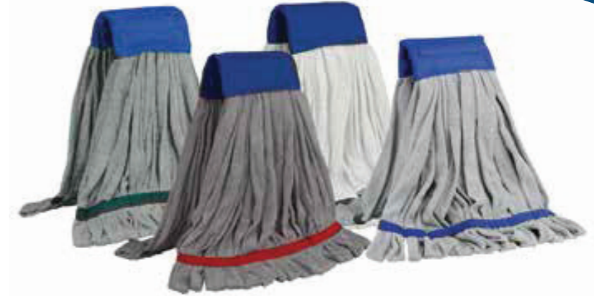
Wet Mop Microfibre Refill