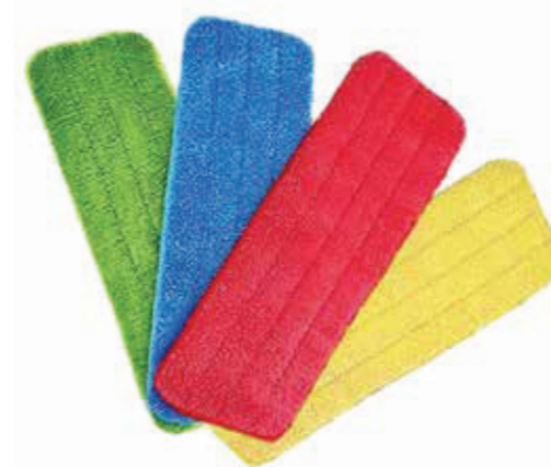
Wet Mop Microfibre Refill

High Quality Plastic Mop Holder, with Microfibre / Cotton Colour coded Mop Refill and Aluminum Handle with Grip.