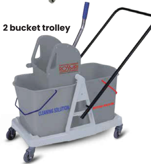
2 bucket trolley