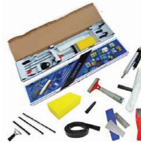
Window Cleaning Set