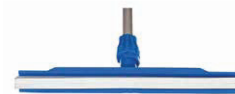
Floor Squeegee Double Rubber