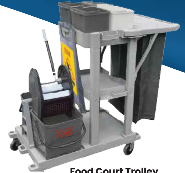
Food Court Trolley