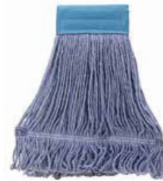
Wet Mop Cotton Refill

Office Sanitary Hospitals Kitchen Please use colour coded products as per application area