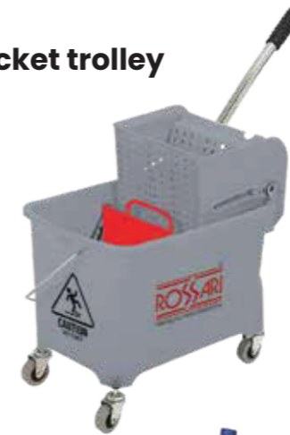
1 bucket trolley