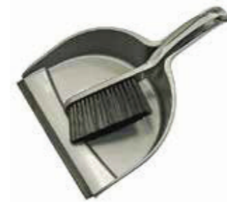
Dust pan with Brush