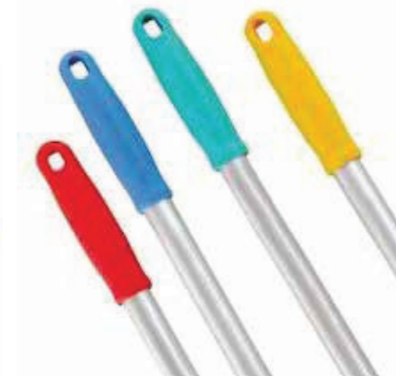
Wet Mop Aluminium Handle