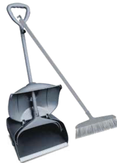
Dust Pan with Broom