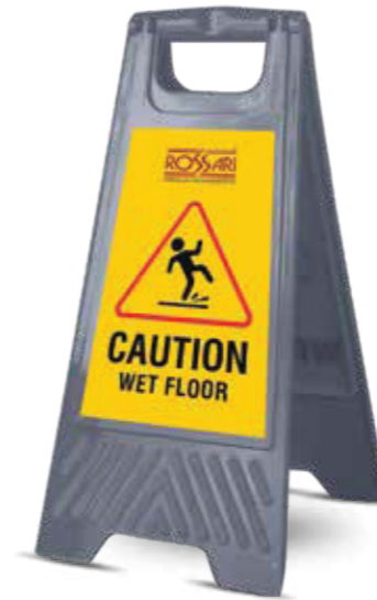
Signages CAUTION WET FLOOR