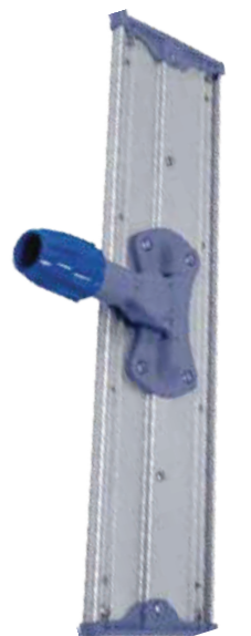
Flat Mop Set